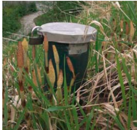
Contaminated flood waters can enter wells